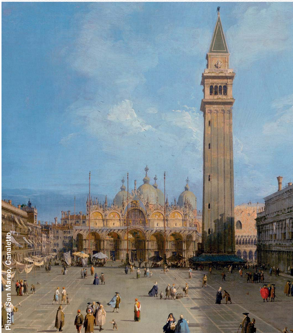
Piazza San Marco, Canaletto

FOR FURTHER ITINERARY INFORMATION CONTACT: