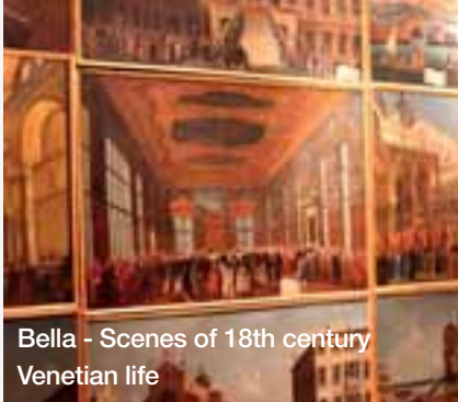
Bella - Scenes of 18th century Venetian life