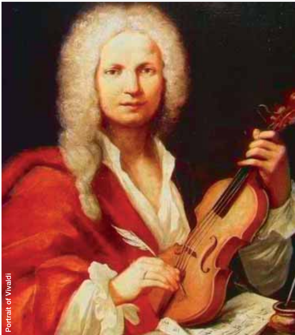
Portrait of Vivaldi

FOR FURTHER ITINERARY INFORMATION CONTACT: