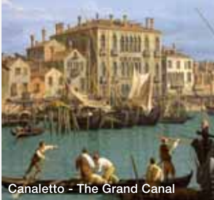
Canaletto - The Grand Canal