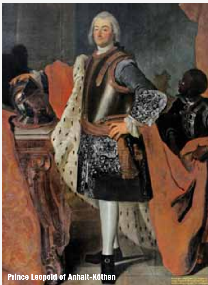
Prince Leopold of Anhalt-Köthen

After checking out of our hotel, we travel back to Berlin for our flight home. En route (and final flight times permitting) we visit the Moritzburg Museum in Halle, recognised as possessing one of the most important art collections in Germany. We also enjoy a final included lunch together, after which we continue to Schönefeld Airport in good time