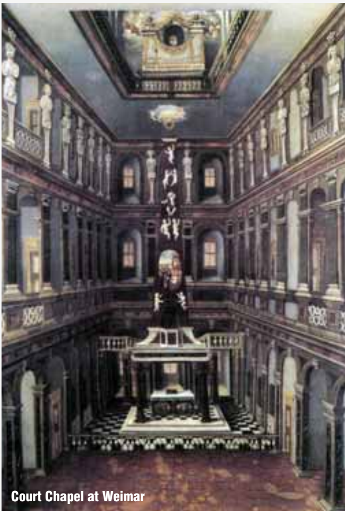
Court Chapel at Weimar