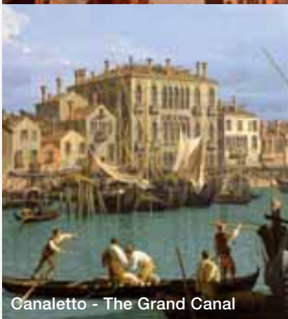
Canaletto - The Grand Canal