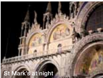
St Mark's at night

By exploring the art galleries and museums of Venice, visiting the places associated with Vivaldi's life, listening to his music in the concert halls and churches of Venice, this tour will bring Venice's greatest musical son bursting into life.