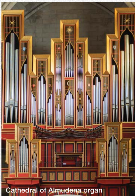
Cathedral of Almudena organ