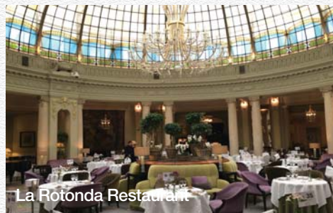
La Rotonda Restaurant