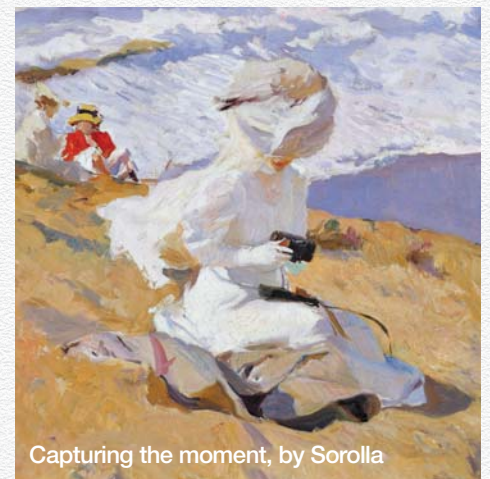
Capturing the moment, by Sorolla

After the last of our morning lectures, and after checking out of our hotel, we have a visit to El Museo del Romanticismo which is a museum housed in an 18th century building devoted to artefacts from the Romantic period. It contains a wide range of impressive period paintings but also is home to many 19th century pianos and other musical instruments. We follow this with a group lunch and a little free time in the afternoon before making our way to the airport for our return flight to London Heathrow.